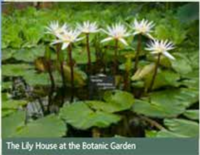
The Lily House at the Botanic Garden